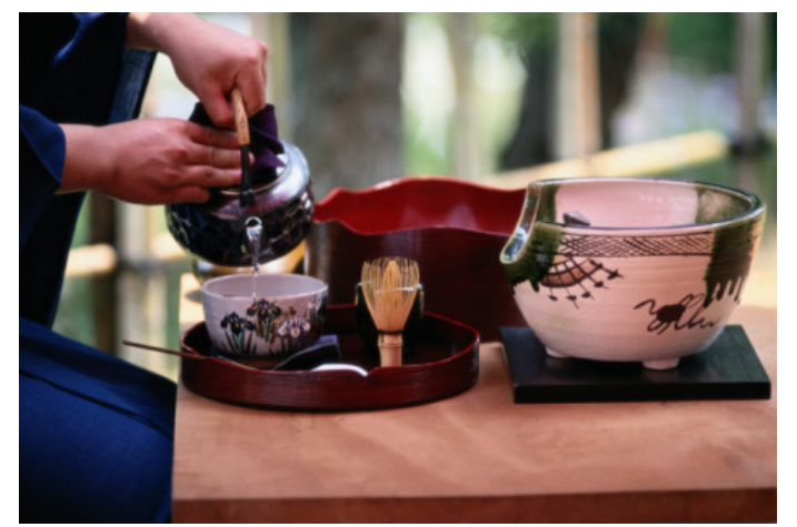
Green tea is part of the traditional Japanese diet

A study that suggested that <u>green tea could</u> <u>reduce the likelihood of developing prostate</u> <u>cancer</u> had a similar weakness. It found that men who drank five cups of green tea a day were about half as likely to develop advanced prostate cancer as those who drank only one cup. This study involved nearly 66,000 men in Japan, who were followed for 14 years. It was a study with a large number of participants and a