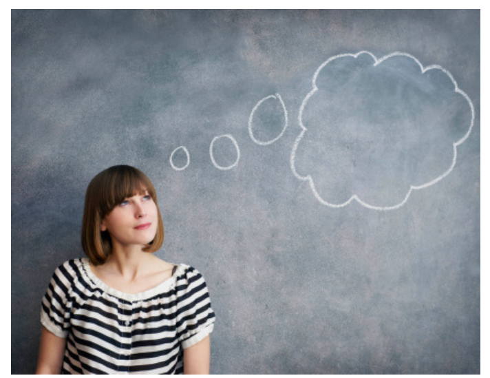
Our memories aren't always very reliable

Telomeres shorten each time a cell divides, so telomere length is often used as a proxy measure for (an indicator of) biological ageing.