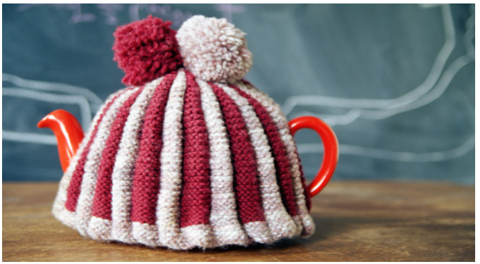
The nation's favourite drink is supposedly good for you

Miracle claims are also made for chocolate, including that a daily bar "<u>can cut the risk of</u> <u>heart attack and stroke</u>".