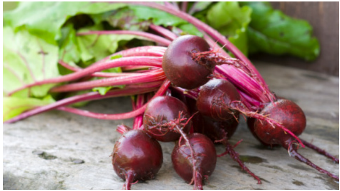
Beetroot has been called 'the elixir of life'

Of course, there's more to it than that. There's a vast industry devoted to finding new ways to persuade us to eat this or that food and an army of scientists bent on exploring the links between what we eat and how healthy we feel.