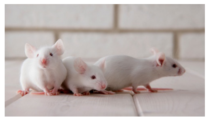
Testing on mice is not the same as testing on humans

Eating fish three times a week was associated with a non-statistically significant reduction in risk of these brain abnormalities. Even if the difference had been significant, the study could not say whether oily fish prevents memory loss, as memory was not measured. Only a trial that directly measures people's memory can tell us about the link between oily fish and memory.