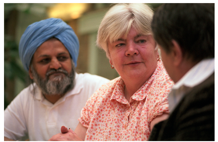
People react differently to different things

long follow-up, both of which are strengths. But it's possible that men who drink lots of green tea are also more likely to adhere to a traditional Japanese diet. This means diet may be a confounding factor. In fact, this is partly what the researchers found – that men who drank more green tea also ate more miso and soy, as well as fruit and vegetables. They also differed in other ways from men who drank less green tea. So it's difficult to say for certain whether the green tea is responsible for the lower risk of cancer or whether other elements in the diet were involved.