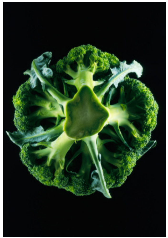
Broccoli is good for you as part of a healthy balanced diet

Eating more non-starchy vegetables, such as broccoli, is associated with a reduced risk of cancer according to the WCRF systematic review on cancer prevention (see above). It is possible that some of the compounds in broccoli may have health benefits, but clinical trials are needed to investigate this.