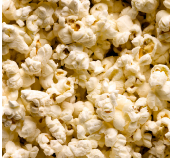
Popcorn is reputedly high in antioxidants

While broccoli can allegedly "<u>undo diabetes</u> <u>damage</u>", "<u>stop breast cancer spreading</u>" and "<u>protect the lungs</u>".