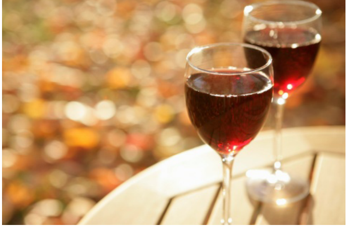
Red wine features regularly in the news

Some of these limitations are discussed below. Knowing about them will help you to sort science fact from news fiction.