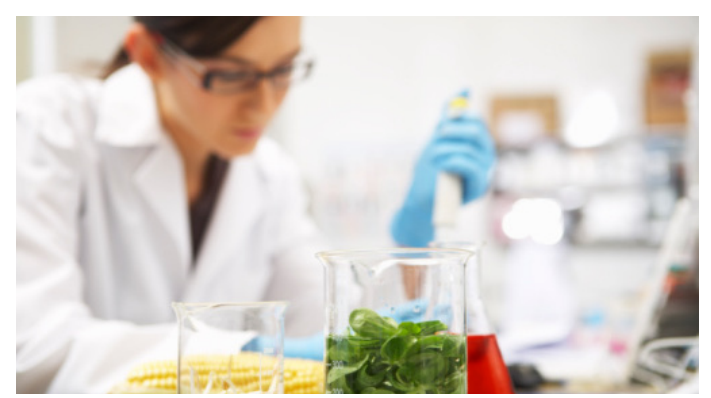
Compounds in food may react differently in the body

Sometimes, a suggested association between a food and a health outcome looks doubtful on the basis of common sense. In such cases we have to ask ourselves whether the association seems plausible. For instance, in the study linking chocolate consumption to better cardiovascular health, people who ate the most chocolate had a 39% lowered risk of heart attack or stroke compared with those who ate the least chocolate. However, the difference in consumption between those who ate the most and those who ate the least chocolate was minimal: less than one small square (5g) of a 100g bar. Common sense tells us that this difference is unlikely to account for a 39% reduction in cardiovascular risk. The idea that helping yourself to a bar of chocolate a day will stop you having a heart attack or stroke may sound attractive, but this research does not provide any basis for it.